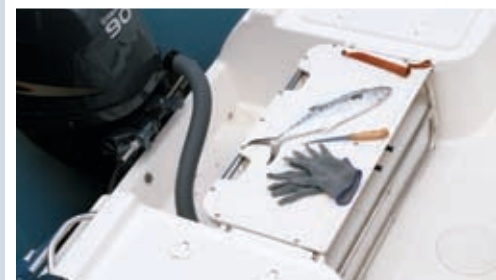
Optional rear seat folds forward to reveal a casting platform and/or cutting board.