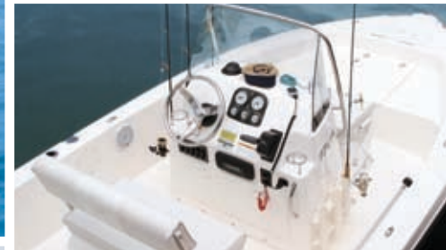
Open deck space and easy access to everything is part of the design.