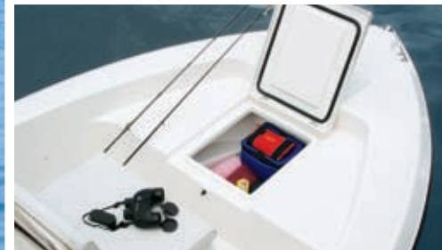
Up front, you'll find a 180-quart, well-insulated fish/storage box.