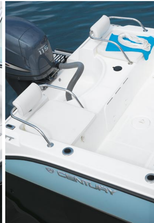
Rear seating with hidden storage and baitwell.