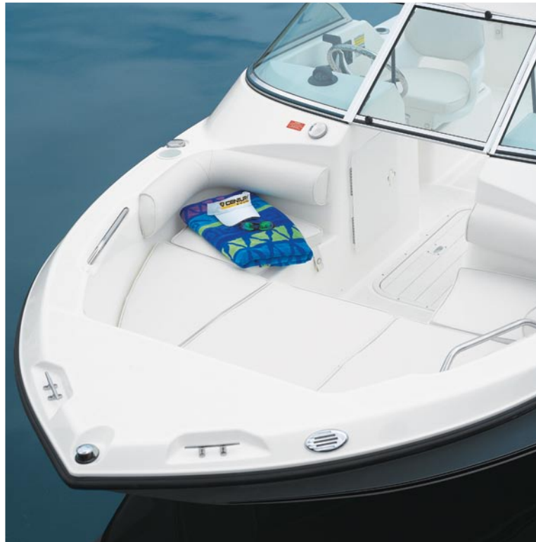
Optional cushioned bow seating provides storage and comfort.