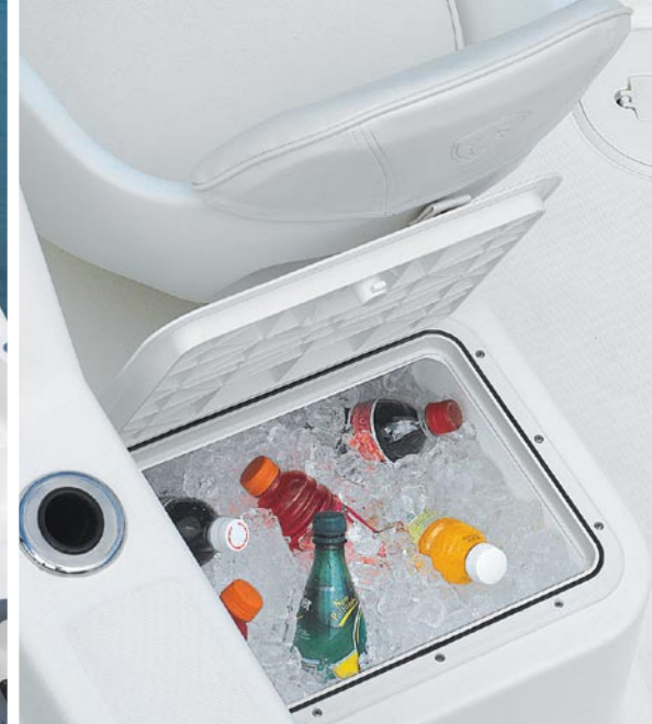
Insulated boxes are great as coolers, fish boxes or storage.