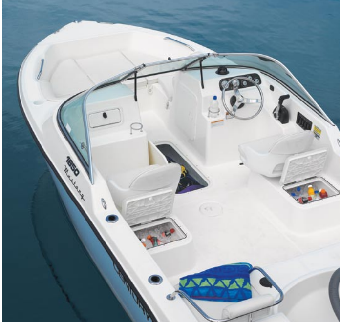
Spacious cockpit with walk-thru windshield.