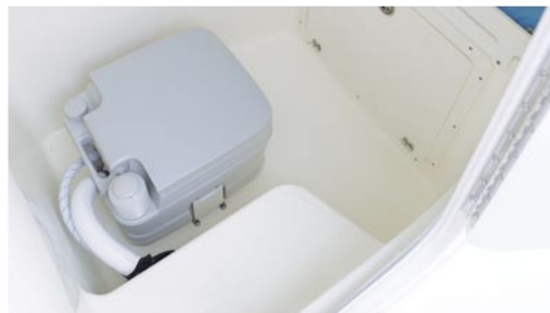
Enclosed portable head stores conveniently, with optional pump-out system.