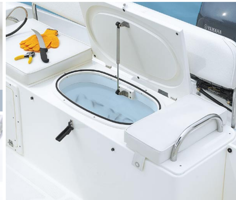
Calming blue 30-gallon baitwell helps keep your bait lively and fresh.