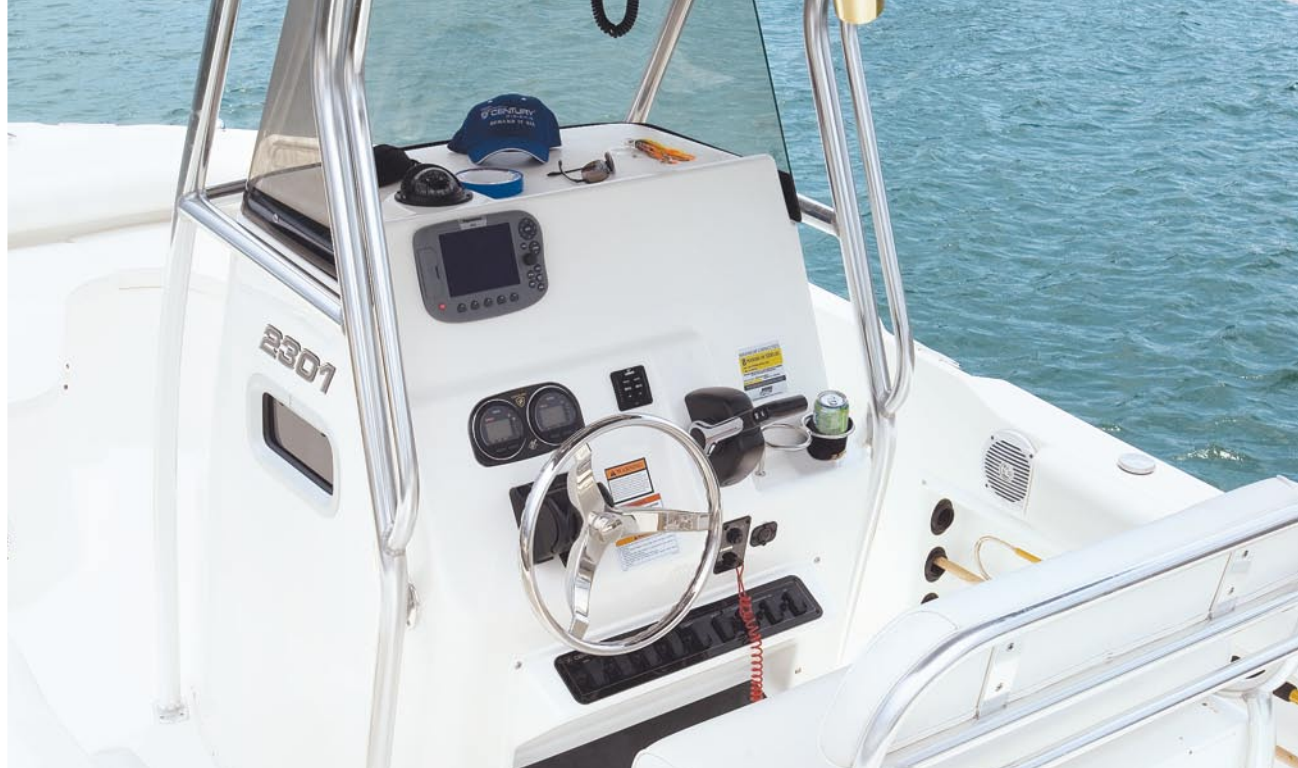
Multi-function helm keeps you in command and in control, while it also accommodates flush mounted electronics. (Shown here with optional Raymarine® A65)