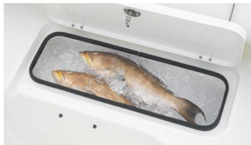
Port and starboard insulated fish boxes with overboard drain take care of your catch.