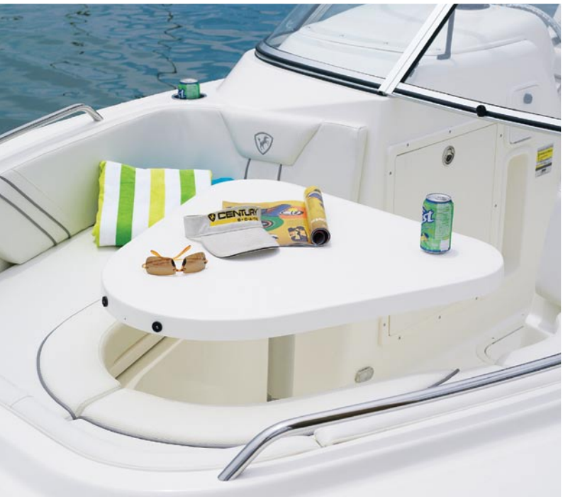
Removable, dinette style bow table provides quick change from lounging area to dining area in only a few seconds.