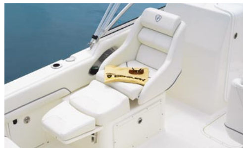
Swivel port chaise allows easy spotting of skiers while catching some sun.