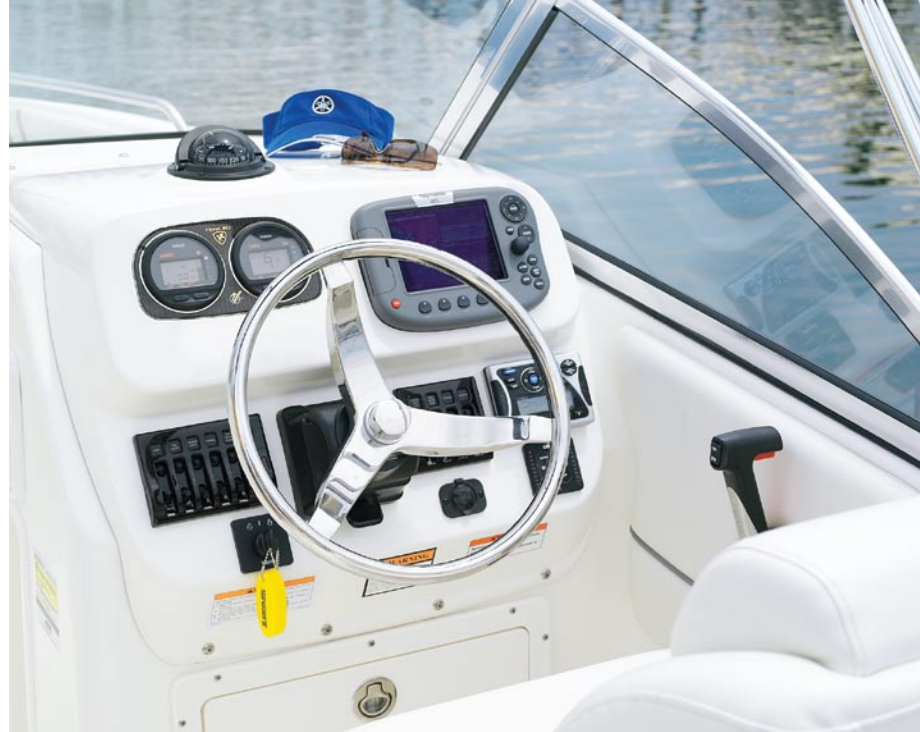
Helm features deluxe captain's chair, hydraulic steering, and design that accepts flush-mount electronics. (Shown here with optional Raymarine® A65)