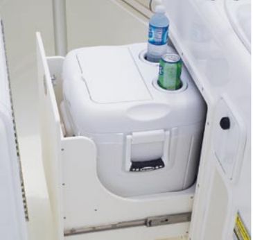
Slide-out drawer cooler placed under the helm that can be pulled out for convenience.