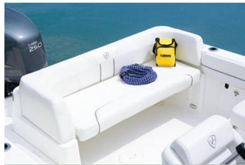
Plush, comfortable rear seat folds down for more deck space.