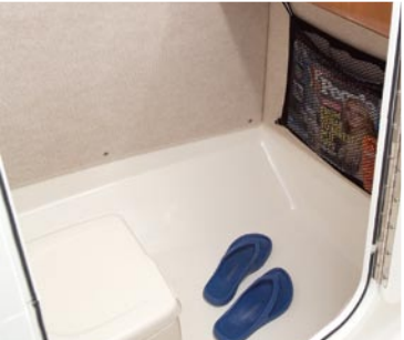
Enclosed head features a storage cabinet.