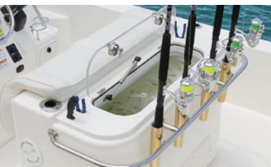
Leaning post with easy access 25-gallon baitwell and rod holders.