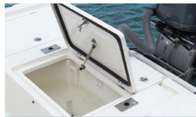
35-gallon live-release well conveniently located in rear deck.