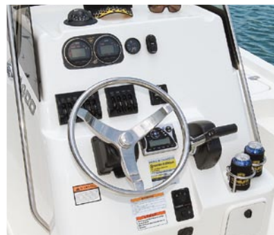
Functionally designed helm accepts flush mounted electronics.