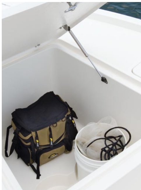
380-quart oversized bow storage with molded base to hold two standard sized 5-gallon buckets.