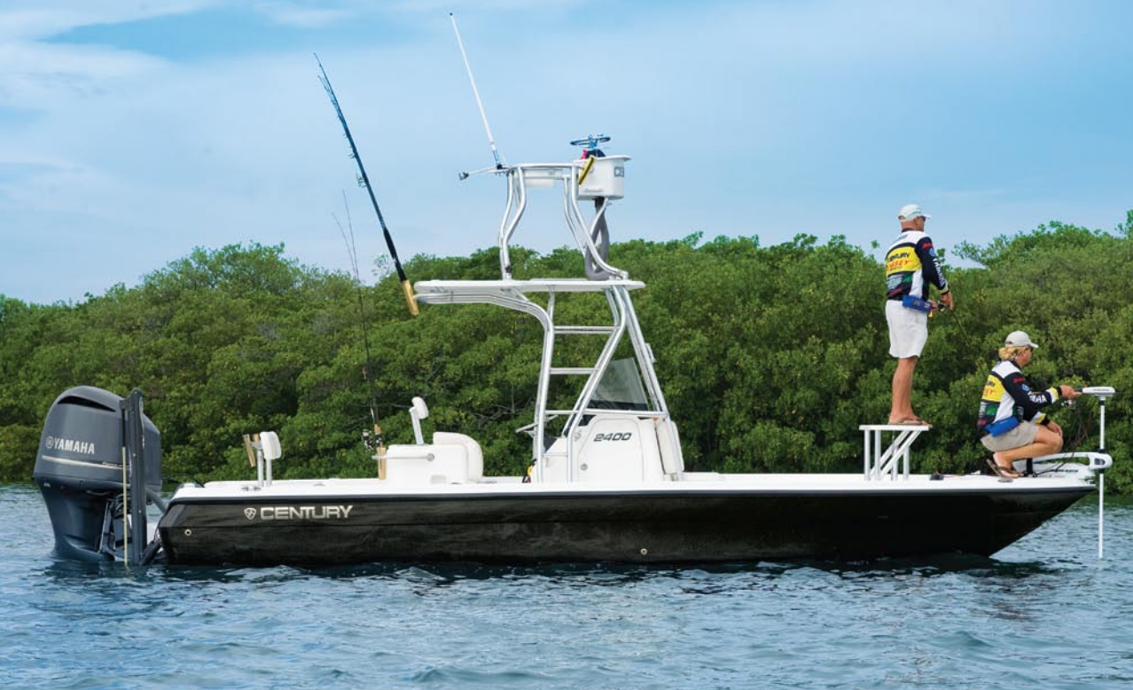
The 2400IS Tower Edition features a dual helm station and Yamaha Command Link® gauges.