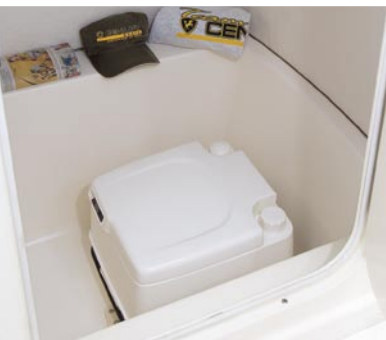
Console-enclosed portable head.