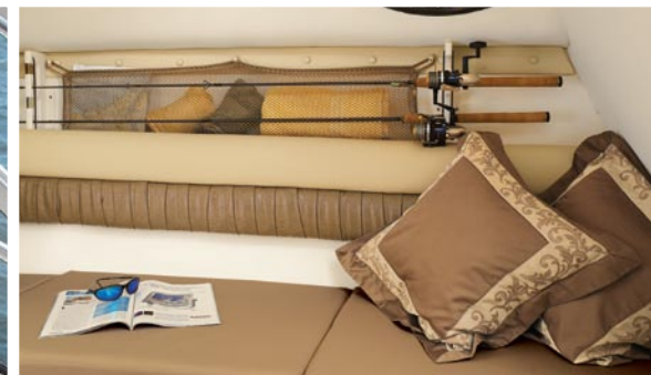
Soft cushions provide a comfortable escape with ample storage throughout the cabin.