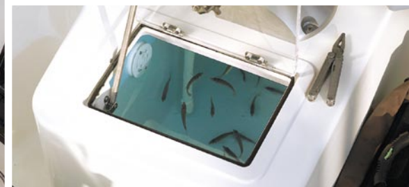
37-gallon calming blue aerated baitwell with clear lid beneath port seat.