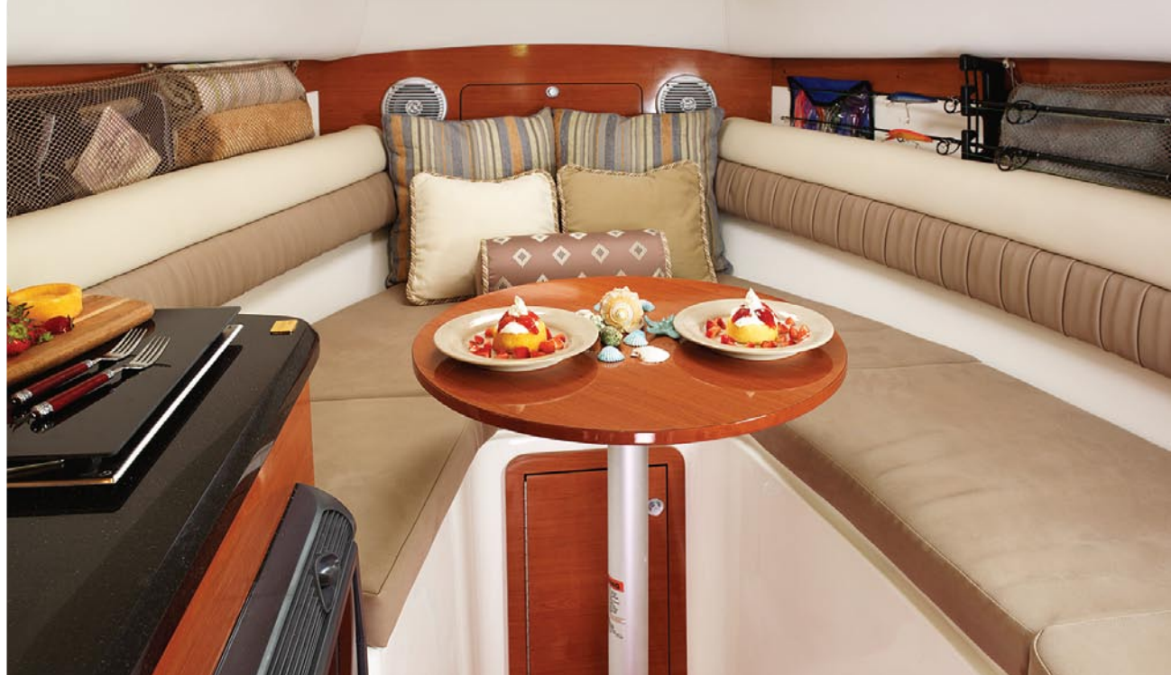
Enjoy true relaxation below with sink, pantry, refrigerator, and stove that all come standard. (Optional interior upgrade shown)