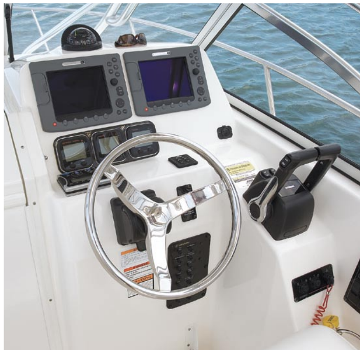
Helm specially designed for flush mounted electronics. Yamaha Command Link® gauges standard. (Shown here with optional dual Raymarine® E80s)