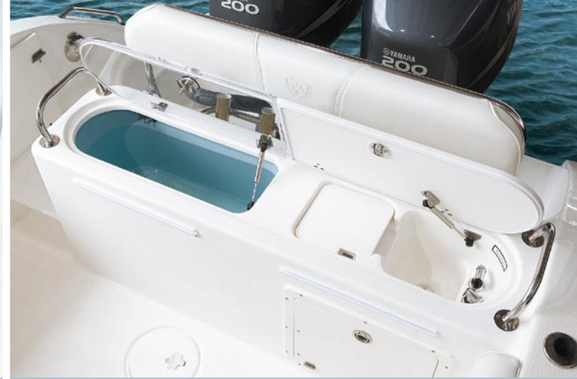
Rear seating opens up to reveal 42-gallon, aerated, calming blue baitwell, complete with sink and fresh/raw water washdown.