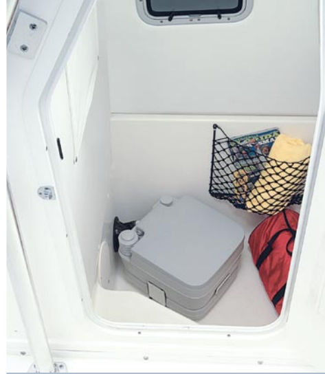
Enclosed head with storage compartments.