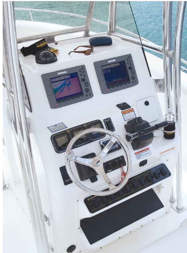
Lockable storage box and console designed to accommodate flush-mount style electronics. (Shown here with optional dual Raymarine® E80s)