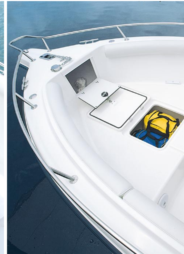
Forward bow area lets you stow anchor and extra gear.