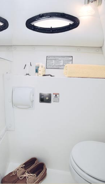
Below deck, an enclosed fiberglass head with shower.