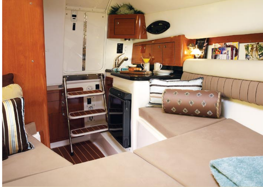
Below deck, a conveniently designed full galley, complete with stowable dinette. (Optional interior upgrade shown)