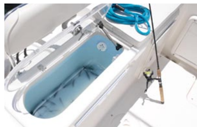
Calming blue baitwell with fully accessible clear lid and compression latch.