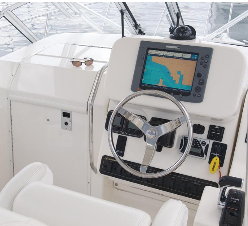
Helm specially designed for flush mounted electronics. Yamaha Command Link® gauges standard. (Shown here with optional Raymarine® E120)