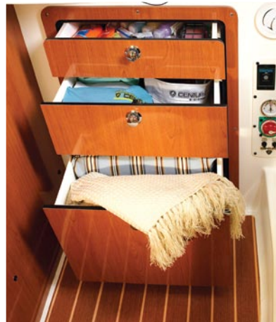
Spacious drawers for hideaway convenience. (Optional interior upgrade shown)