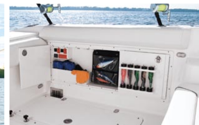
Portside tackle center features hanging tackle bag, (5) lure tubes and ample storage.