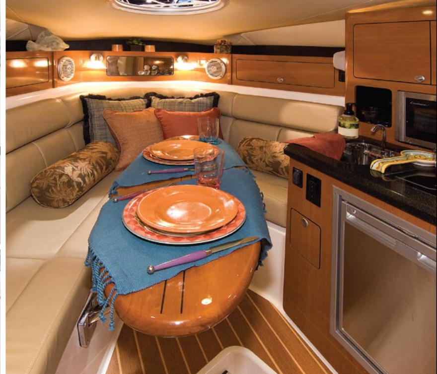
Beautifully-appointed cabin with wood interior, electric stove, microwave oven, AC/DC refrigerator, stainless steel sink and Corian® countertop. With ample seating for dinner guests, it's great to let the sun or the stars shine in with (3) opening foredeck hatches with screens.