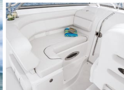
Lounge-style seating, cup holders, plush cushions, A/C vents and easy storage.