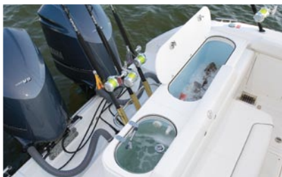
30-gallon aft baitwell with clear lid and compression latch paired with 220-quart primary fishbox with overboard drain.