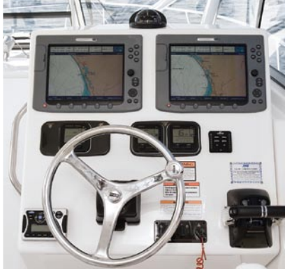
Helm features flush mounted electronics (shown here w/ optional dual Raymarine® E120s), trim tab switches, Yamaha Command Link® gauges, tilt steering, A/C vent, watertight stereo and MP3 player storage box.