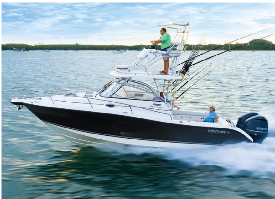
The 2900 Express Tower Edition is designed for hard core off-shore fishing with the added advantage of sighting fish.