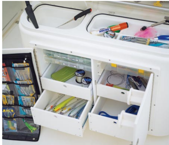
Optional tackle center provides ample storage and rigging sink.