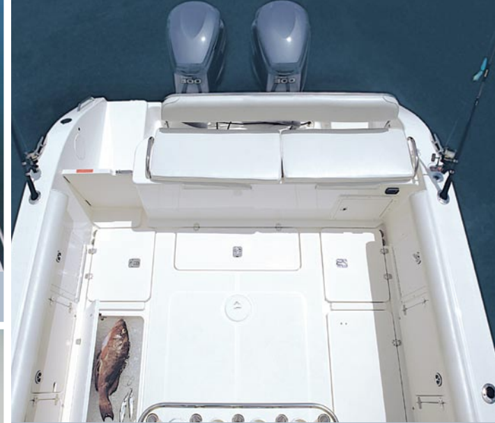
Fishing made easy—62-gallon aerated baitwell, washdown, huge fish boxes and storage lockers for your gear.