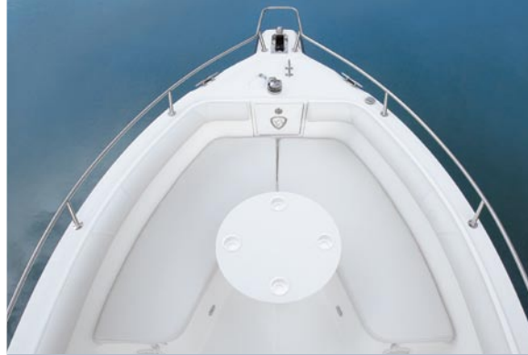
Forward seating converts to an optional dinette in seconds.