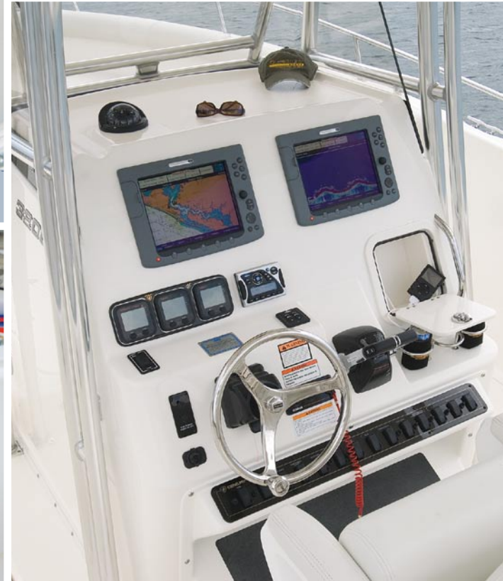
Ergonomically designed helm ready for flush mounted electronics. Yamaha Command Link® gauges standard. (Shown here with optional dual Raymarine® E120s)