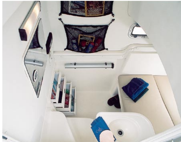
Head enclosure allows for privacy and more convenient storage.