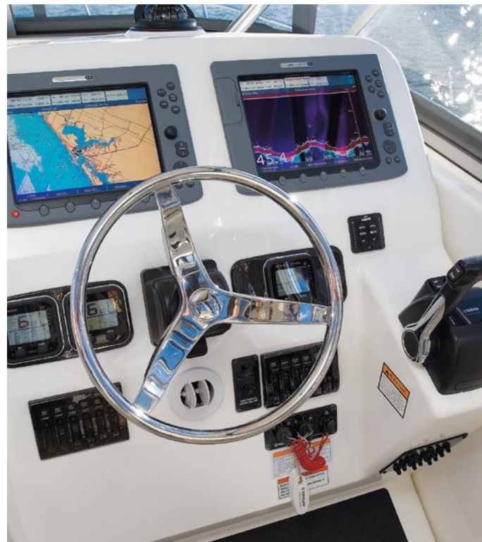
Helm is packed with features like flush mounted electronics (shown here with optional dual Raymarine® E120s), trim tab switches, Yamaha Command Link® gauges, tilt steering, A/C vent, watertight stereo and MP3 player storage box.