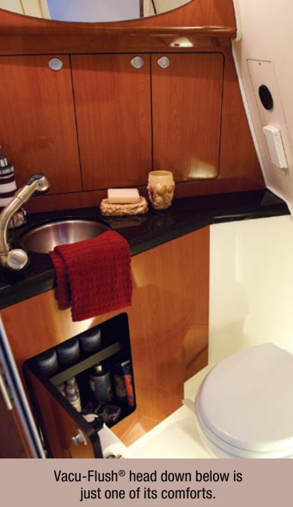
Vacu-Flush® head down below is just one of its comforts.