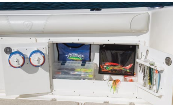
Tackle center with hanging tackle bag, (2) leader wheel holders, (2) tackle trays, (3) floor storage compartments and (3) lure tubes.