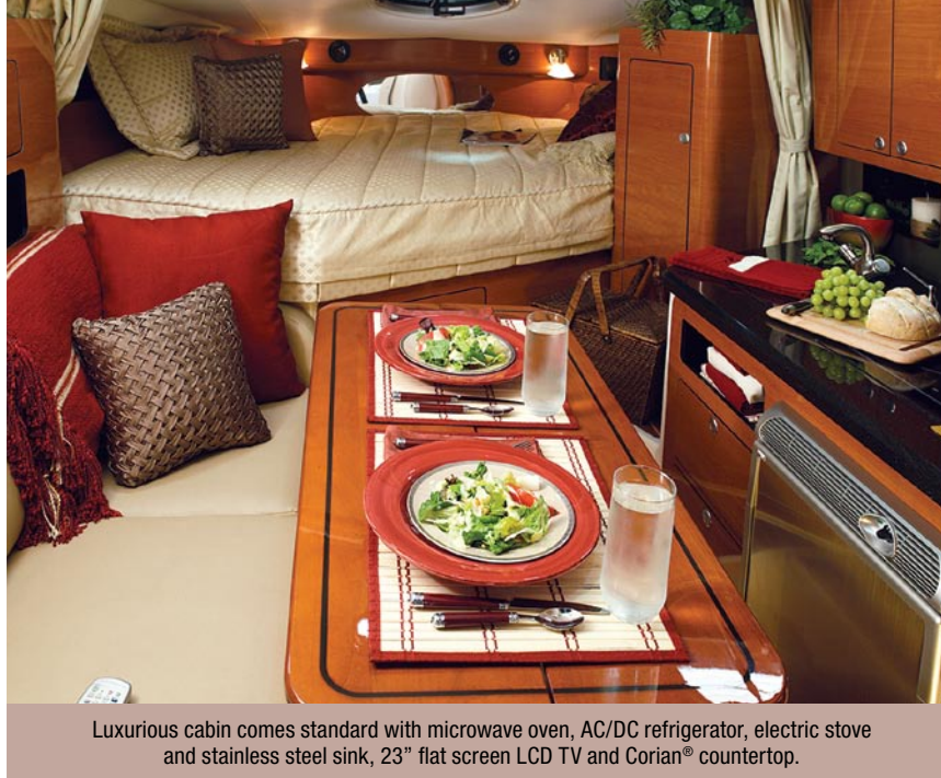
Luxurious cabin comes standard with microwave oven, AC/DC refrigerator, electric stove and stainless steel sink, 23" flat screen LCD TV and Corian® countertop.