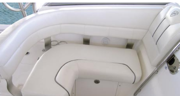
Wrap-around lounge seating with stainless steel back supports, 360-degree air conditioning vent, stainless steel cup holders, (2) large drawer storage units w/ stainless steel latches and slides.